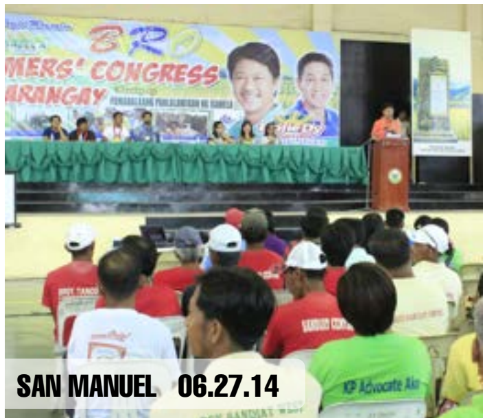
SAN MANUEL 06.27.14