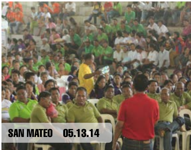
SAN MATEO 05.13.14