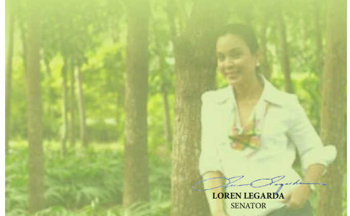
LOREN LEGARDA SENATOR

Delivering well in these two expectations is a legacy which you could certainly be proud of. I wish for the success of this regional summit and may we all work together for a safe, green, and resilient Philippines.