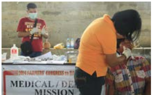
MEDICAL / DE MISSION