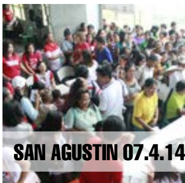
SAN AGUSTIN 07.4.14