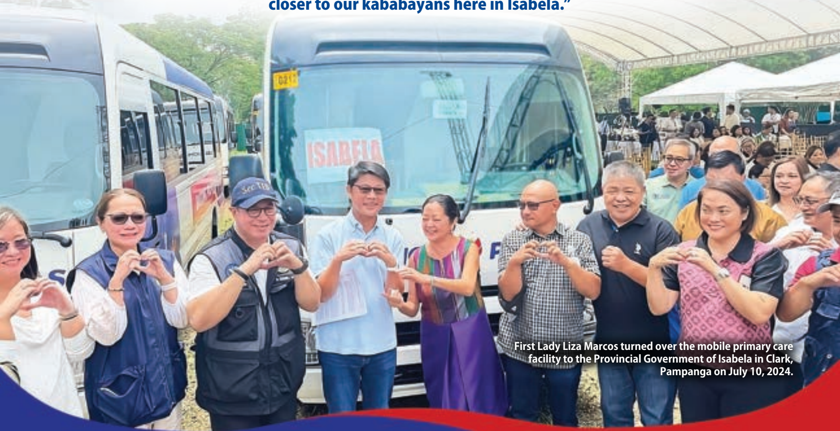
First Lady Liza Marcos turned over the mobile primary care facility to the Provincial Government of Isabela in Clark, Pampanga on July 10, 2024.

“Ang LAB for All program ay hindi lang tungkol sa pagbibigay ng mga serbisyong medikal. It is also about bringing various government services from the different agencies like CHED, DA, DILG, DMW, DOH, DSWD, FDA, PAO, PCSO, PhilHealth, and TESDA. They want to bring services closer to our kababayans here in Isabela.”