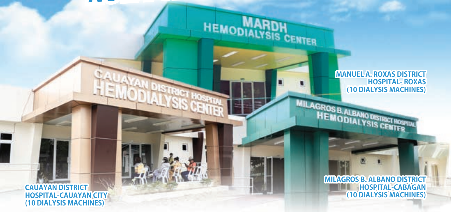
CAUAYAN DISTRICT HOSPITAL-CAUAYAN CITY (10 DIALYSIS MACHINES)